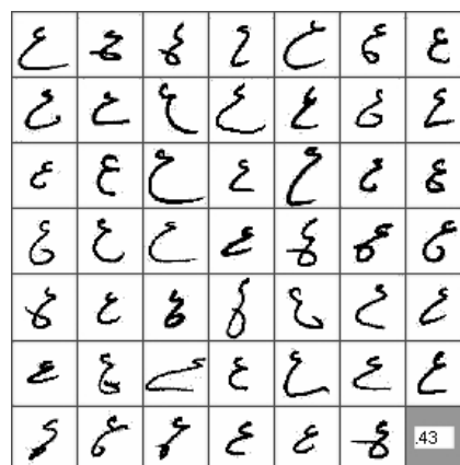
Figure 1: Forty-Eight-Sample Page for the Letter Ain

To conduct our experiments, we used a database of handwritten samples collected from 48 different persons [5]. The 48 persons wrote the same text. Then we collected similar characters from the 48 persons into pages. Figure 1 shows the sample page for the character Ain (ع).